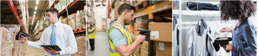
| inventory management | eliminating out of stock | putaway and replenishment