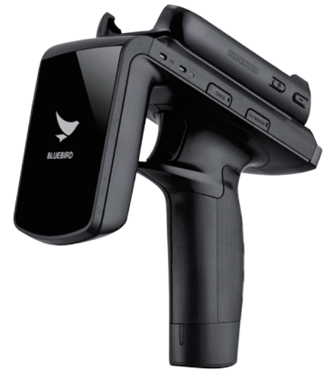
RFID reader RFR900

excellent Bluetooth guarantees reliable data transfer