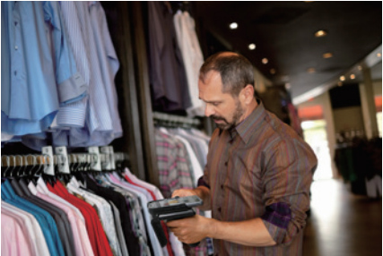
| omni-channel retail