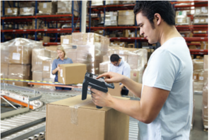
| sorting and receiving operations