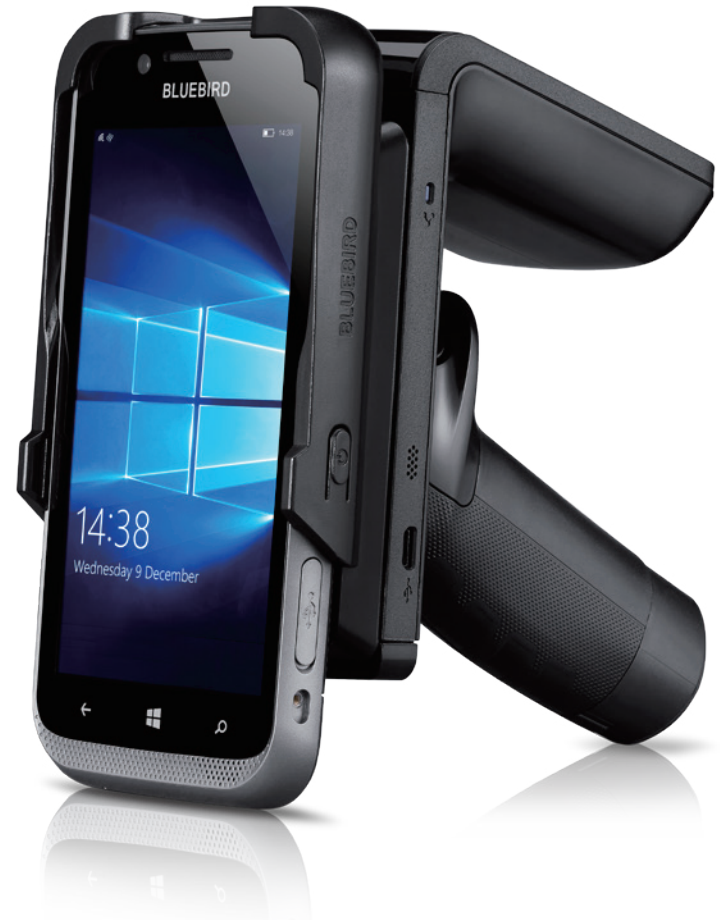
Bluebird RFID reader - RFR900 + EF500

The RFR900 can be charged with Bluebird's touch mobile computer series(EF500, EF400 and BP30) together on the cradle of touch mobile computer so you don't have to charge them separately.