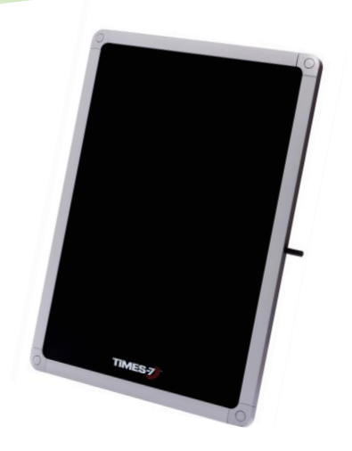
The SlimLine A6032