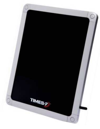
The SlimLine A6031