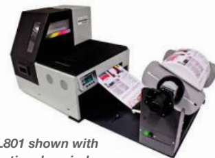
L801 shown with optional rewriter