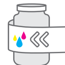
Print & Apply