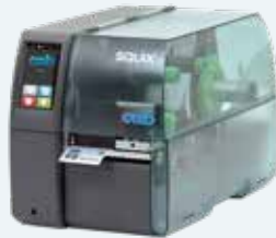
Label printers SQUIX 4 Industrial device for print widths up to 108 mm