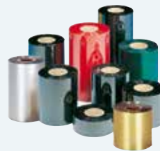
Ribbons in wax, resin and resin/wax qualities