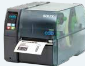
Label printers SQUIX 6 Industrial device for print widths up to 168 mm