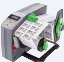
Label dispensers HS, VS for horizontal or vertical dispense