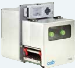
Print modules PX to be integrated in labeling machines