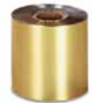
Ink: inside Core Ø: 1"

All information on scopes of delivery, design and technical specifications correspond to the date of the printing. Subject to change. The data provided in the catalog do not represent any warranty or guarantee.