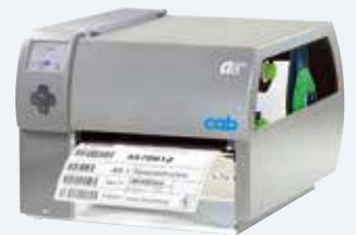
Label printers A8+ Industrial device for print widths up to 216 mm