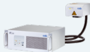
Marking lasers FL+ with output powers 10 to 50 Watt