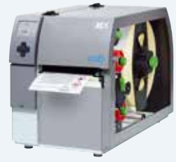
Label printers XC for two-color printing