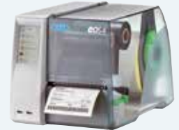
Label printers EOS4 Desktop device for label rolls up to diameter 203 mm