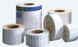
Labels made from more than 400 materials