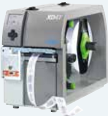
Label printers XD4T for double-sided printing