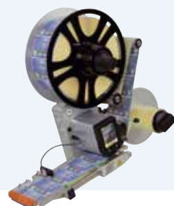
Labeling heads IXOR to be integrated in labeling machines