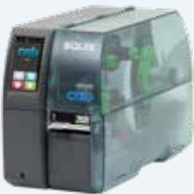
Label printers SQUIX 2 Industrial device for print widths up to 57 mm