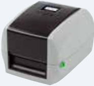
Label printers MACH1, MACH2 in the lower price segment