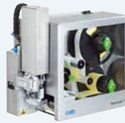
Print and apply systems Hermes+ for automation