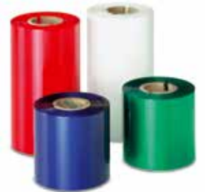
Ink: inside Core Ø: 1"