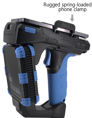
Rugged spring-loaded phone clamp