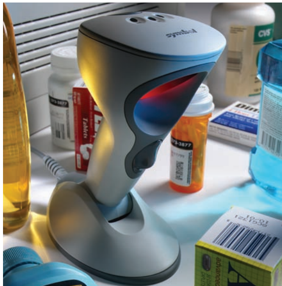
UCC/EAN Composite Symbology combines 1-D and 2-D scanning capabilities.

Bright LEDs indicate which scan pattern is working. For intuitive aiming accuracy, even in the brightest lighting conditions and for can't miss, single-pass scanning, the laser diode emits a highly visible beam for easy-to-see scan patterns. When you lift the scanner off the counter, it automatically switches from hands-free to handheld mode. The Cyclone immediately adjusts the scan pattern for optimum