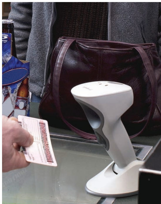
PDF417 bar codes are ideal for age verification applications