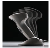
The adjustable built-in stand pivots to make scanning items easy – no matter how large or small.

For more information about the Symbol M2000 Cyclone Series, contact us at +1.800.722.6234 or +1.631.738.2400, or visit us on the Web at: www.symbol.com/m2000