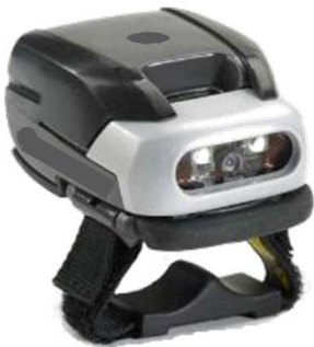
RS507-IM20000ENWR Imager without trigger and extended battery