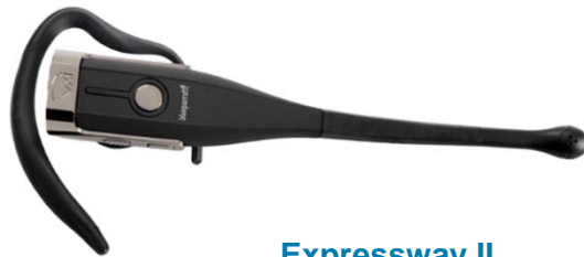
Expressway II Bluetooth Headset for WT41N0