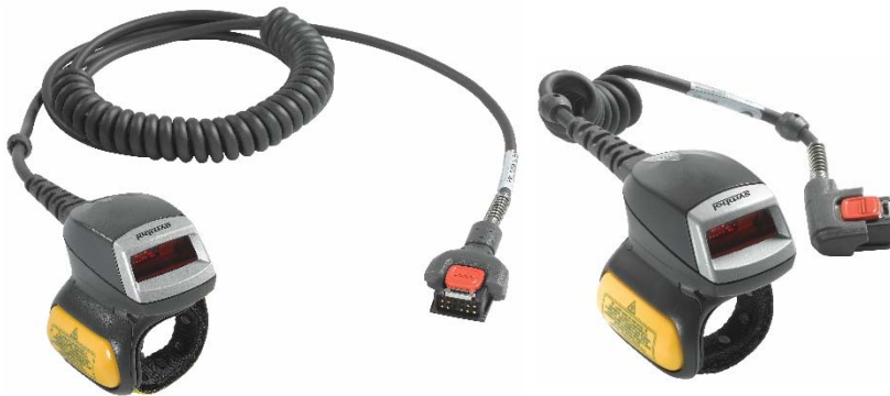
RS419-HP2000FLR Ring scanner for WT41 hip mounted.