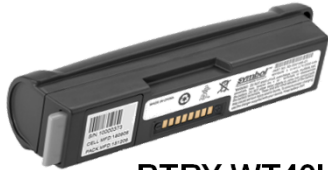
BTRY-WT40IAB0E Standard Lithium Ion battery, 2330 mAh