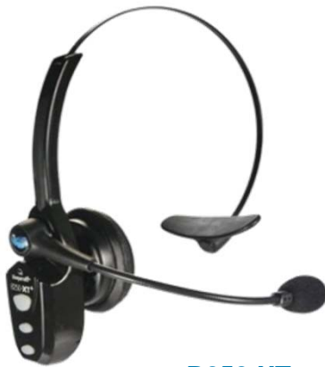
B250-XT+ Bluetooth Headset for WT41N0