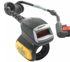
RS419-HP2000FSR Ring scanner with cable to wrist