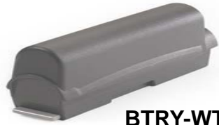
BTRY-WT40IAB0H Extended Lithium Ion battery, 4600 mAh