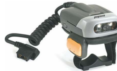
RS507-IM20000CTWR Corded imager with trigger