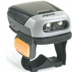
RS507-IM20000STWR Imager with trigger and standard capacity battery