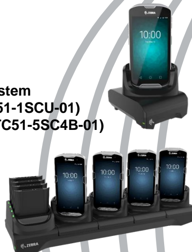
ShareCradle System 1-slot charge (CRD-TC51-1SCU-01) 5-Slot Charge Only (CRD-TC51-5SC4B-01)