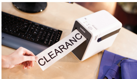
The continuous roll offers the ability to create larger signage on demand

Increase productivity & efficiency by enabling busy retail workers to print a wide range of labels on the shop floor by incorporating TD-2000 with a trolley/mobile workstation. With its compact design, the TD-2000 is also ideal to use on crowded retail desktops and counters without sacrificing valuable workspace. Sharp text, logos and barcodes printed quickly on high quality Brother media can help improve customer satisfaction at the counter or check out.