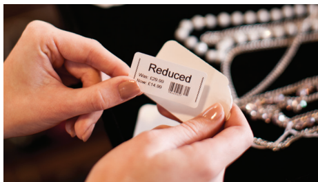
Push through slow moving stock by creating sales labels whilst on the move in store