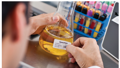
Ensure that patients' samples are clearly and correctly identified