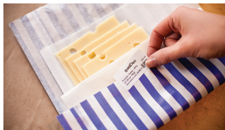
Ensure the safety of your customers with clear 'Use By' labels