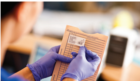
Locate patients' records and other important documentation quickly with an identification label