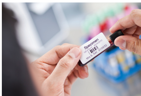
Simply apply your custom designed label