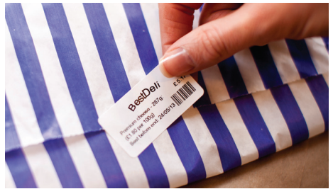
The adhesive used in Brother RD rolls has been certified safe for food labelling