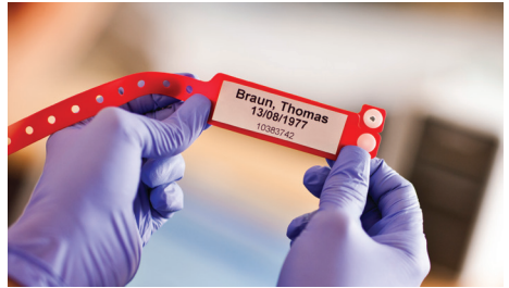
Print basic patient details when required