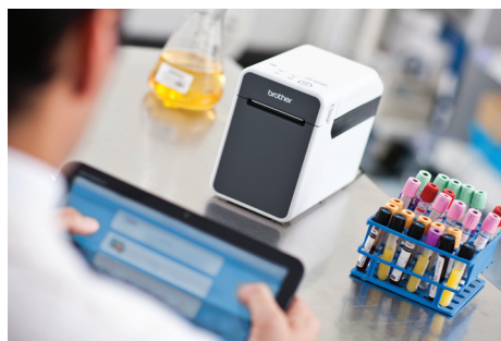
Increased freedom and mobility - print wirelessly from virtually any tablet or handheld device

The Mobile Software Development Kits (SDK) make it easy for developers to incorporate label and receipt printing into mobile apps. There are SDKs available for iOS™, Android™ and Windows Mobile™.