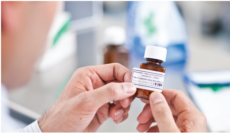
Label sizes can be adjusted to fit different sized tablet containers

The network models (2120N & 2130N) provide healthcare workers with the option of wirelessly printing a variety of labels quickly and whenever needed in the laboratory, pharmacy, front desk or even at the patient's bedside. With support for the most common barcode protocols, all models are ideally suited to any labelling task in healthcare.