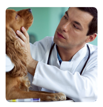
HID can create a custom tag solution to fit your application requirements for chip type, dimensions, programming and materials.