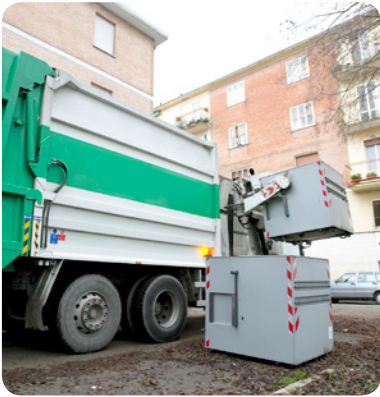
HID can create a custom tag solution to fit your application requirements for chip type, dimensions, programming and materials.