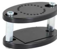
3PTY-PCLIP-215677 Forklift Clamp Mount