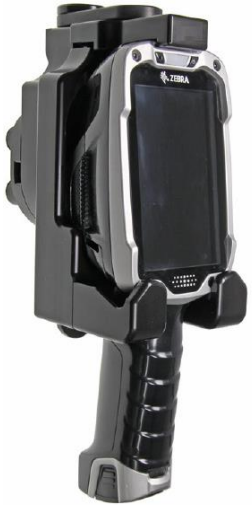
MNT-TC8X-FLCH-01 Forklift Holder for TC8000