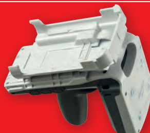
For BHT-1800: EA-SP1-A1800

The SP1 attachments now bring all the advantages of RFID and makes them available for your existing smart devices. With BHT-1800 or Quad Lock rotary attachment for Android™ and iOS devices - SP1 is always ready to connect for an uncomplicated top performance.