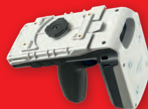
Versatile fixator: EA-SP1-AS