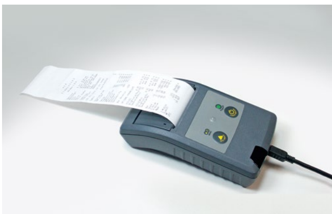
Portable report printer