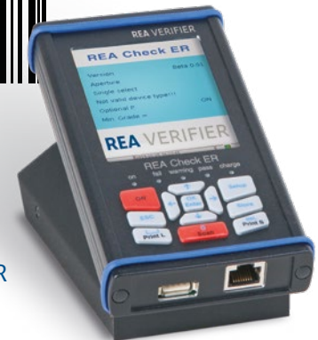
REA Check ER