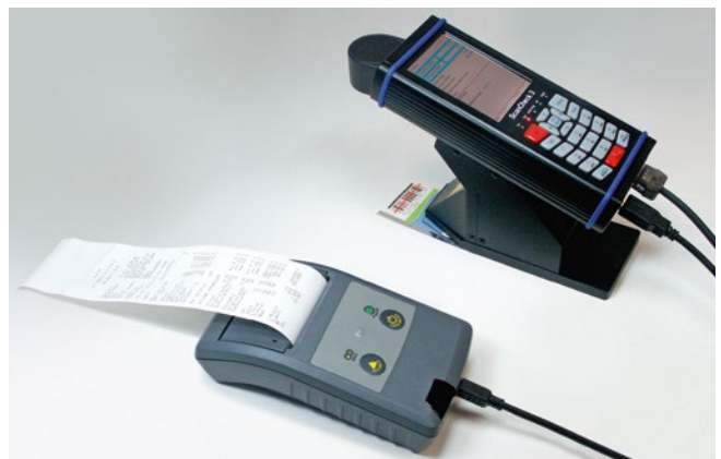
Creation of test protocols