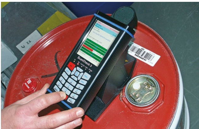
Verifying barcodes on metal barrels