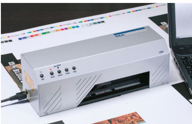
Measuring of barcodes on print sample sheets