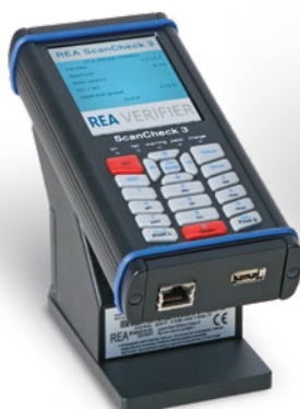
REA ScanCheck 3 (universal, for barcodes, mobile)