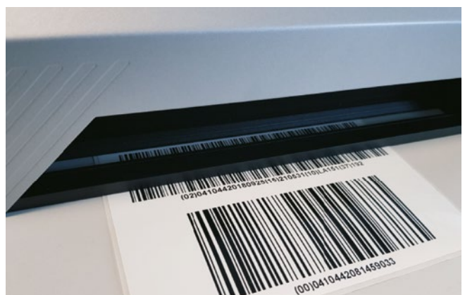
Quality verification of barcodes