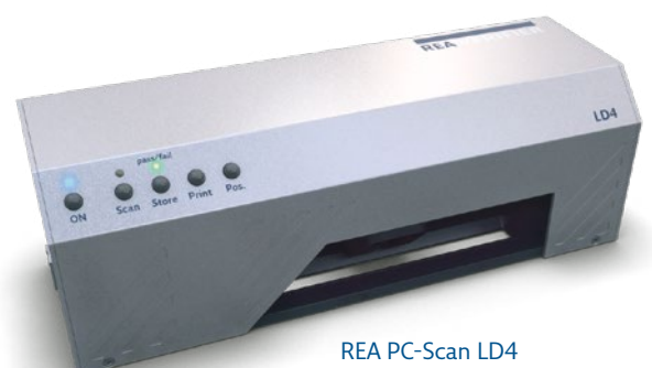
REA PC-Scan LD4 (reference device for barcodes)