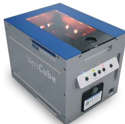
REA VeriCube (for 2D codes and barcodes, ready for 21 CFR Part 11)