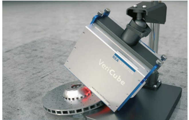
Stand solution for code verification on 3D objects