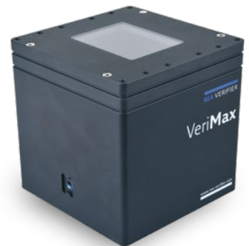
REA VeriMax (for 2D codes and barcodes, for mounting in production lines)