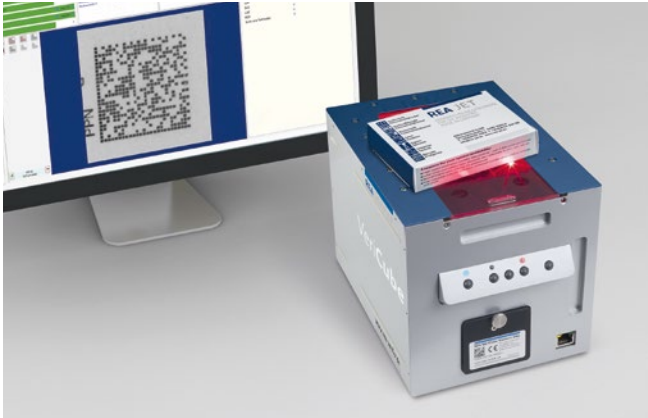
Verification of Data Matrix codes on product packaging