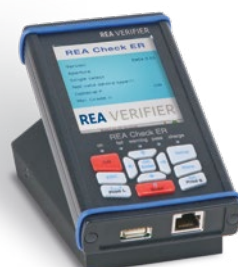
REA Check ER (compact, for barcodes, mobile)