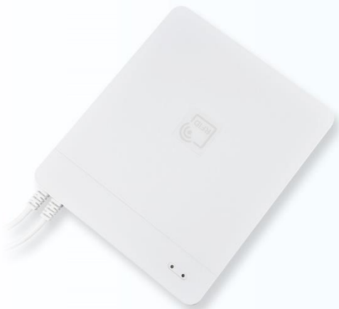
Cashier Counter Site ( business hours + off office hours )