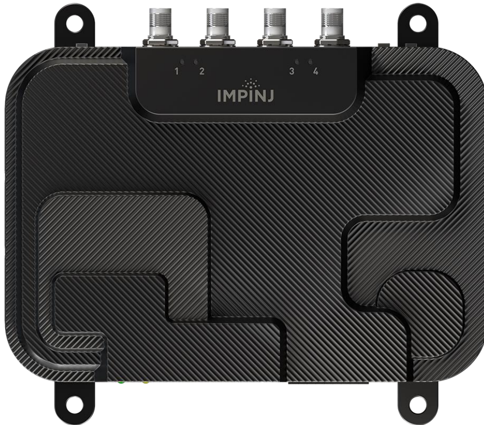
Figure 2: Impinj R700 Bottom View