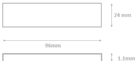
Dimensions stated in mm Supply format = 500 labels per roll