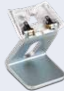
90ACC0379 Tilting Stand, White 90ACC0378 Tilting Stand, Black