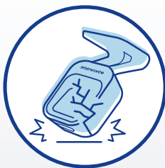
ACCIDENTAL DAMAGE COVERED BY COMPREHENSIVE PACKAGE (OR OPTION)