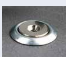
90ACC0384 Magnetic Mount