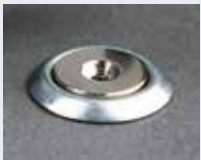
Magnetic Mount 90ACC0384