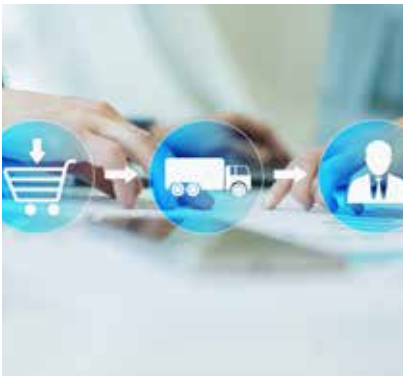
PLANT PRODUCTION & SUPPLY CHAIN DATA