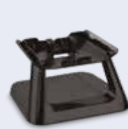
90ACC0380 Riser Stand, Black 90ACC0381 Riser Stand, White