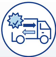
BOTH WAYS FREIGHT PAID BY DATALOGIC*