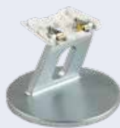
90ACC0401 Round Stand, Silver Base, White Scanner 90ACC0400 Round Stand, Black Base, Black Scanner 90ACC0402 Round Stand, Silver Base, Black Scanner