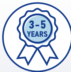
3-5 YEARS CONTRACT SERVICE OPTIONS