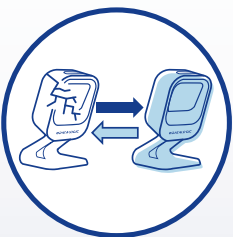
FAST REPAIR TURNAROUND (OVERNIGHT / 2 DAYS / 3 DAYS / 5 DAYS)