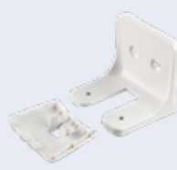
90ACC0383 L Bracket/ Wall Mount, White 90ACC0382 L Bracket/ Wall Mount, Black