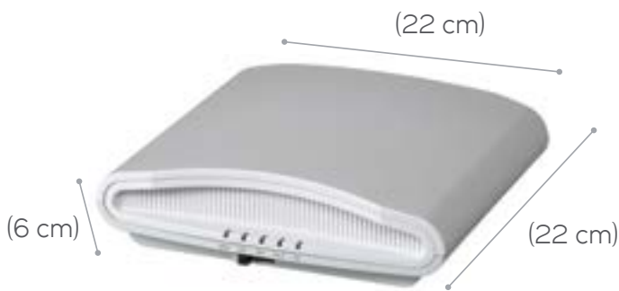
Weight is 1.1 kg. (2.3 lbs.)