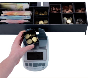
Faster cashing-up with removable cups from the cash draw.

counting procedure. The subtotals are added automatically into a total sum. Besides from banknotes and coins, the RS 1200 also counts coin rolls trouble-free. This version offers the possibility to calculate the float amount and deduct it from the cash receipts. The connection to a receipt printer allows a clear print-out of the cashing-up.