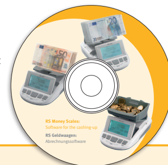
RS Money Scales: Software for the cashing-up RS Geldwaage: Abrechnungsoftware