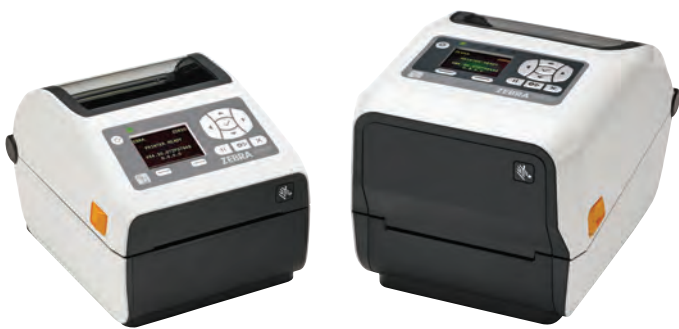
ZD620d-HC with LCD

As a healthcare provider, you need to give your healthcare professionals the tools to provide the very best in patient care, every second of every day. Zebra's ZD620-HC rises above conventional desktop printers with premium print quality and state of the art features. Available in both direct thermal and thermal transfer models, the ZD620-HC offers the most standard features of any Zebra desktop printer, as well as an optional color LCD and 10-button interface that simplify printer setup and status. Designed for healthcare, the ZD620-HC is ready for constant disinfecting and offers a healthcare-compliant power supply. With its optional 300 dpi printing, the tiniest labels are crisp and legible. The ZD620 runs Link-OS® and is supported by our powerful Print DNA suite of applications, utilities and developer tools that deliver a superior printing experience through better performance, simplified remote manageability and easier integration. The Zebra ZD620 — delivering the print speed, print quality and printer manageability you need to keep boost productivity, accuracy and the quality of care.